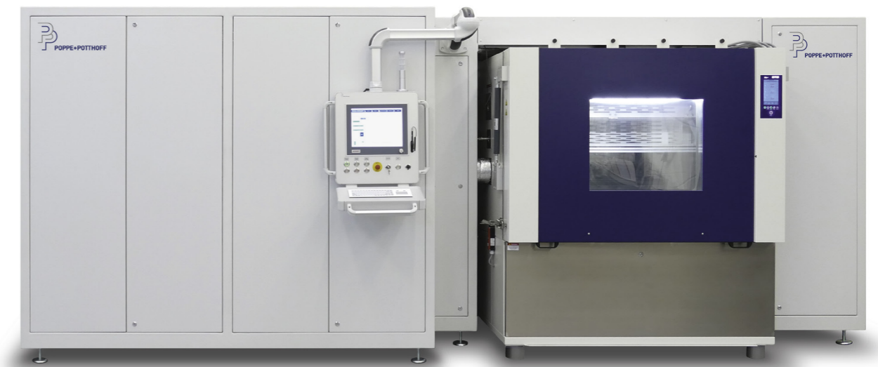
Pressure cycling test stand with climate chamber

The integrated LabView software from National Instruments enables efficient data acquisition and visualization. Test procedures and data are automatically stored on the system and can be exported to the network for evaluation. The open software structure makes it possible to integrate additional sensors and data during testing. Poppe + Potthoff Group can provide numerous testing services, remote maintenance and on-site technicians, if necessary.