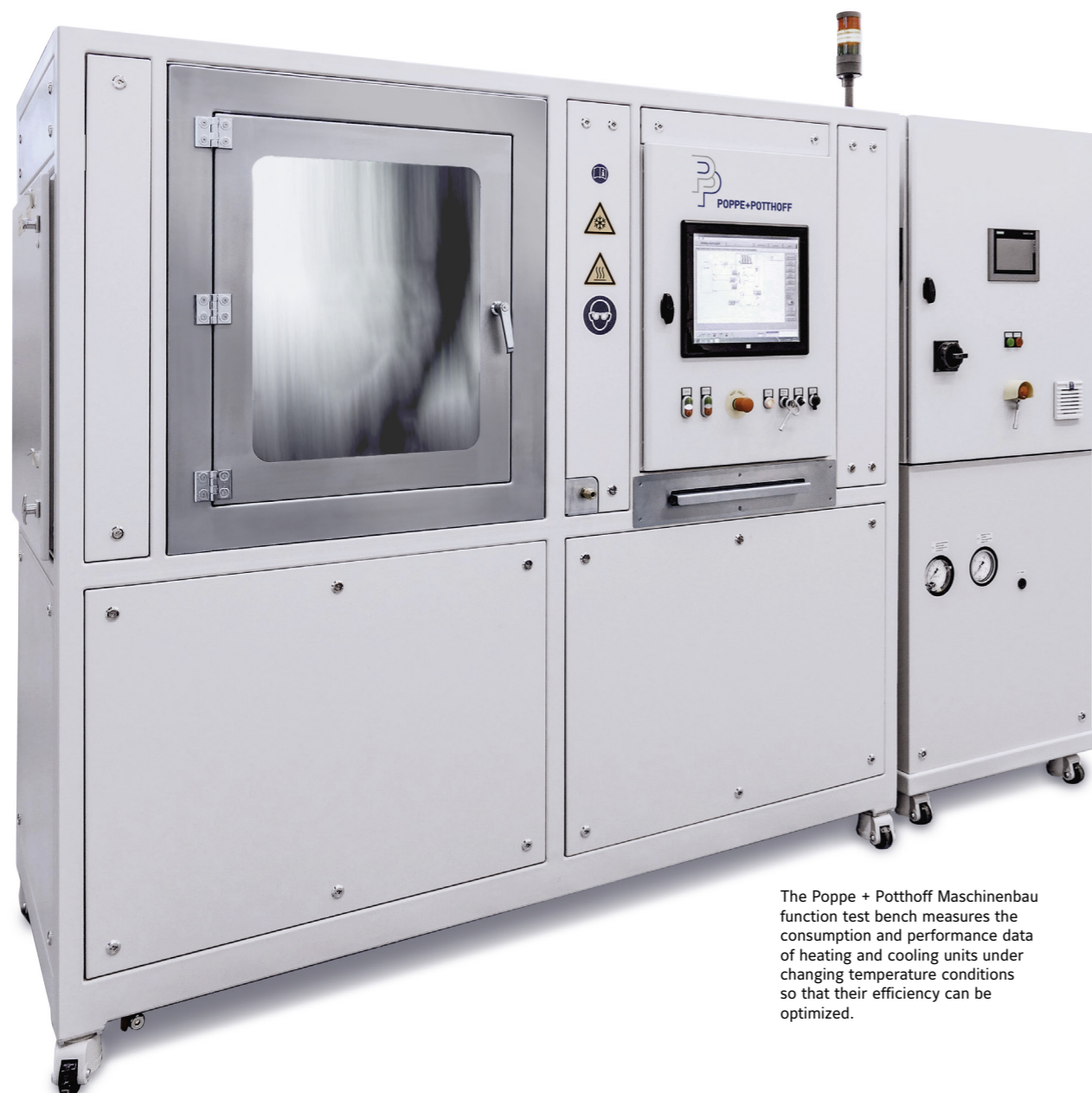
The Poppe + Potthoff Maschinenbau function test bench measures the consumption and performance data of heating and cooling units under changing temperature conditions so that their efficiency can be optimized.

In many EVs, the heating and cooling systems drain the battery and negatively affect the vehicle's range. Comparison of test results before and after a load test on the pressure cycling test bench can show how power consumption and performance change over the vehicle's service life. The test object is connected to the power supply (low voltage 0-20VDC/5A) or high voltage (0-600VDC/150A) and the test media circuit. The test medium is circulated at a temperature of between -35°C to +100°C (-31°F to +212°F) and a flow rate of 1-50 l/min. The test can also be carried out in a climatic chamber at -40°C to +140°C (-40°F to +284°F) simulating changing ambient temperatures.